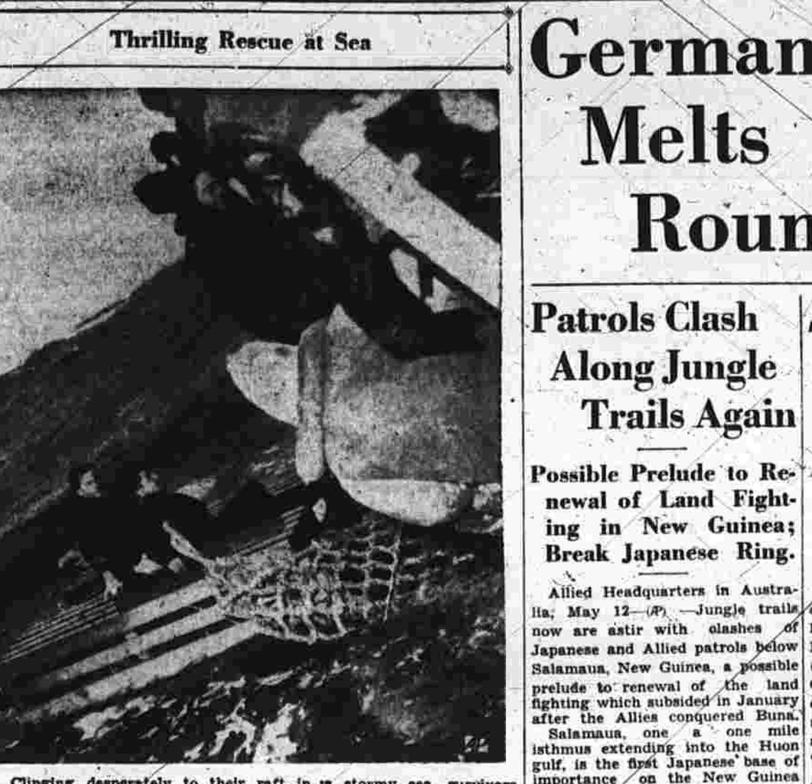
Clinging desperately to their raft in a stormy sea, survivors of a British merchant ship torpedoed in the Atlantic wait their turn to be taken aboard the U. S. Coast Guard cutter, which found them.

Study Hitting Of Vesuvius The British are studying the possibility of limiting extensions of a day's supply in storage. The result is to be reported under the Red Cross.